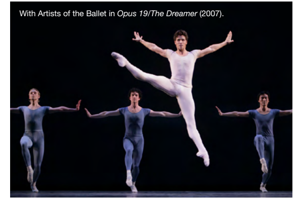
With Artists of the Ballet in Opus 19/The Dreamer (2007).