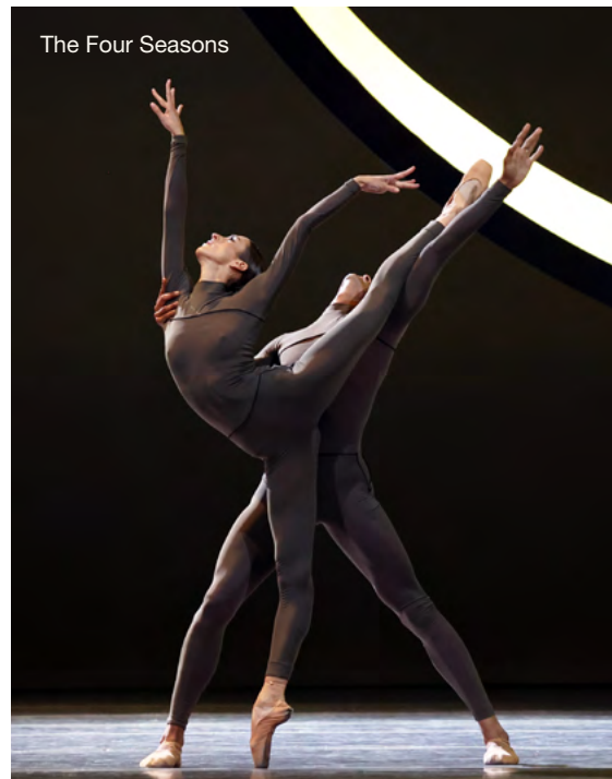
The Four Seasons