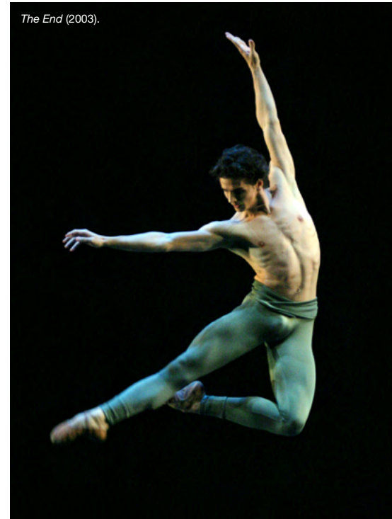
The End (2003).