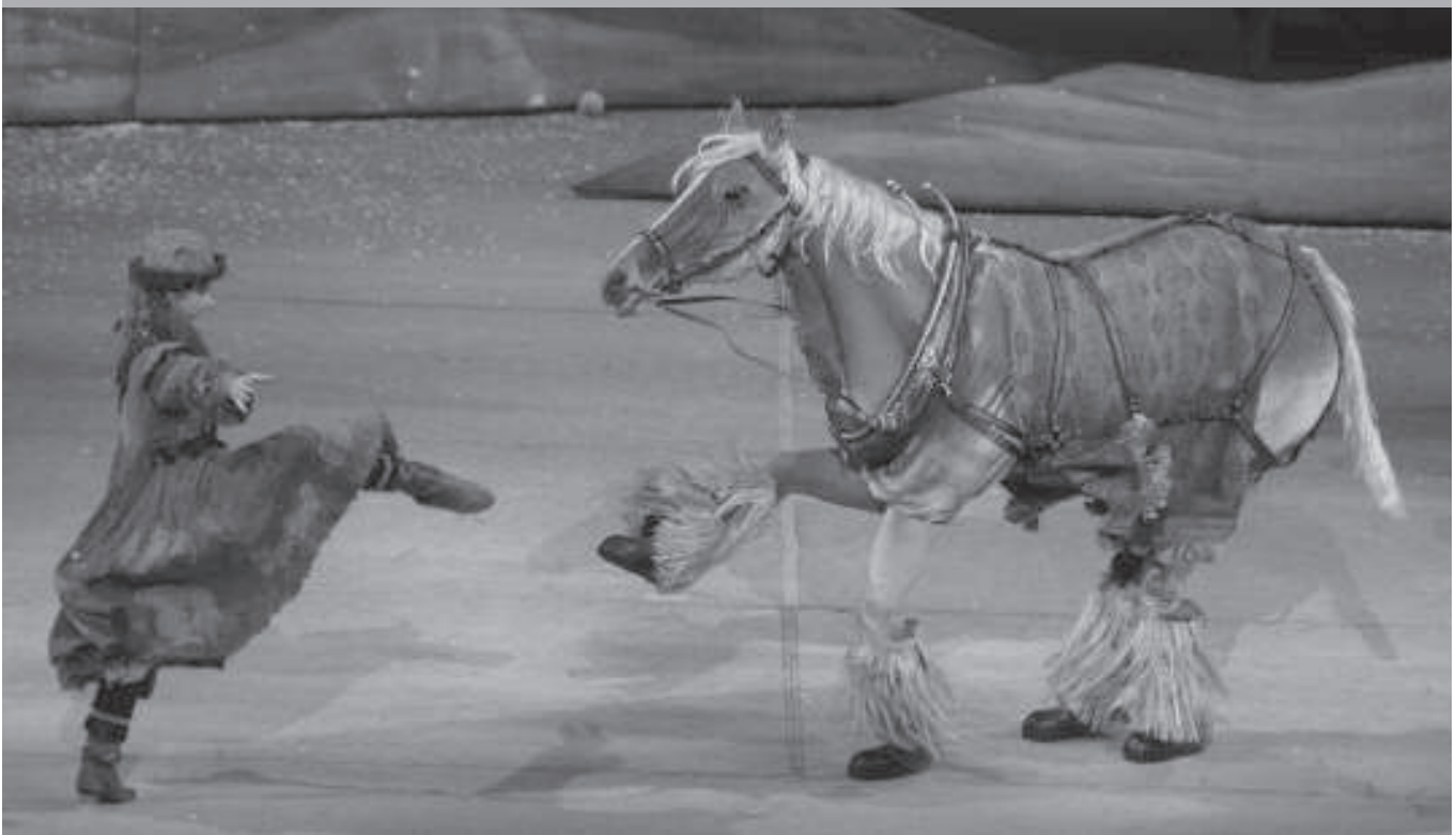
Piotr Stanczyk and Artists of the Ballet.