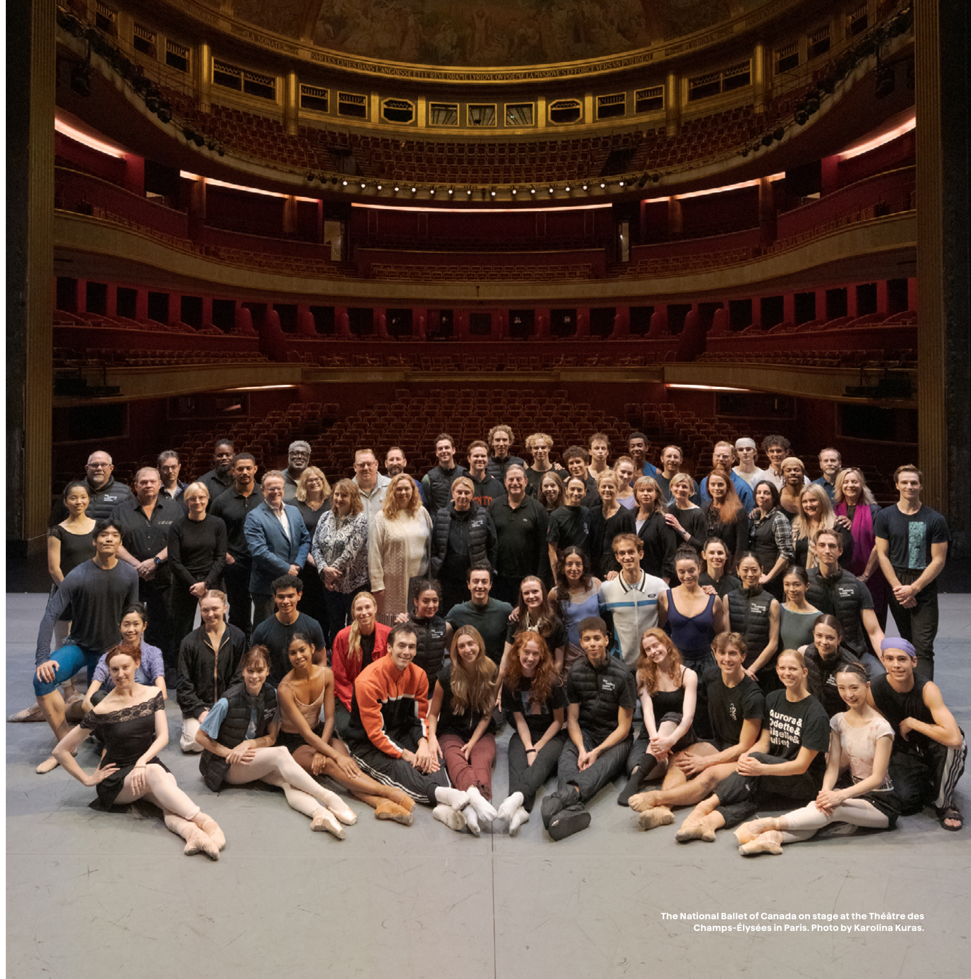
The National Ballet of Canada on stage at the Théâtre des Champs-Élysées in Paris.