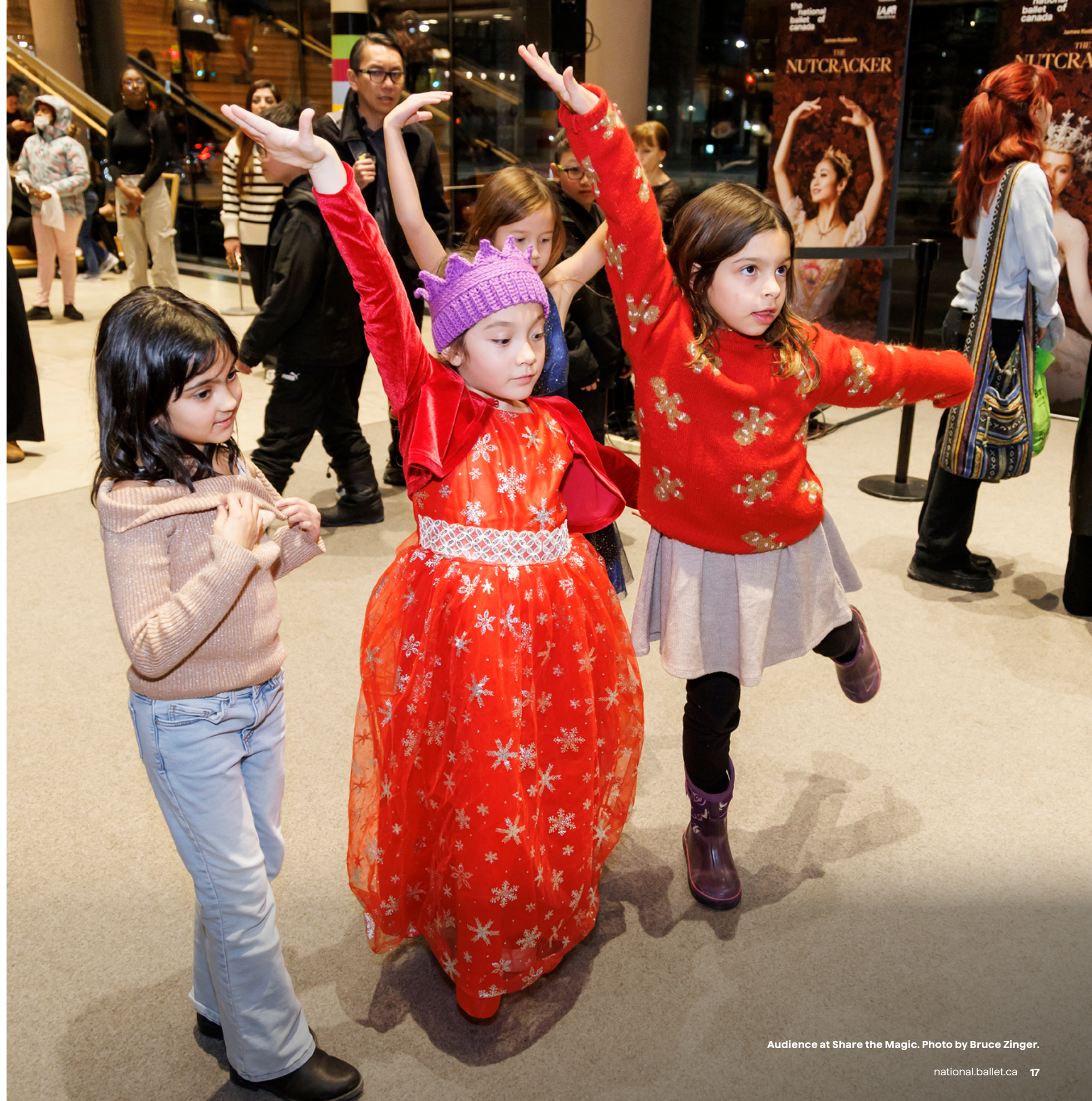
Audience at Share the Magic.