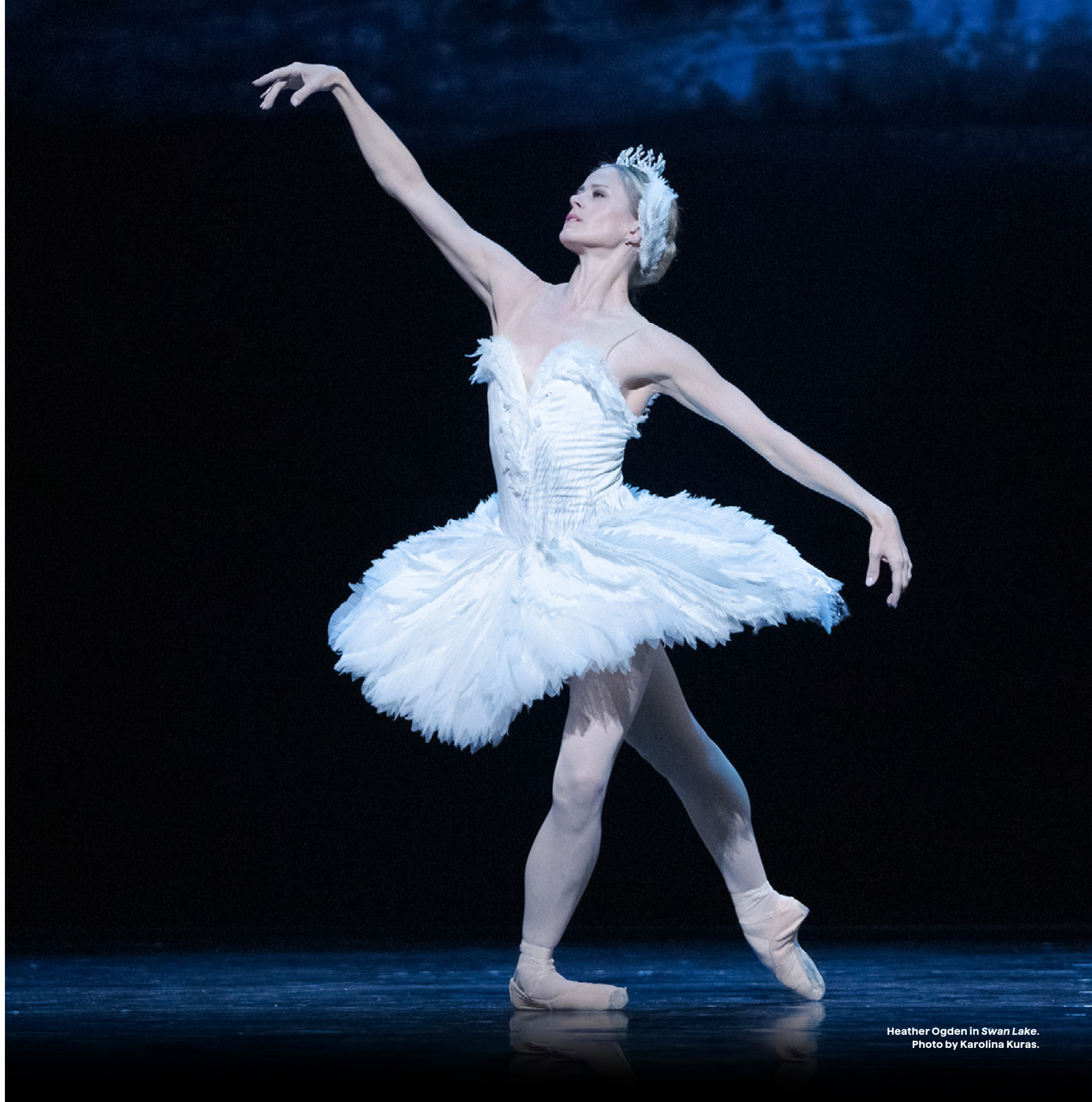
Heather Ogden in Swan Lake .