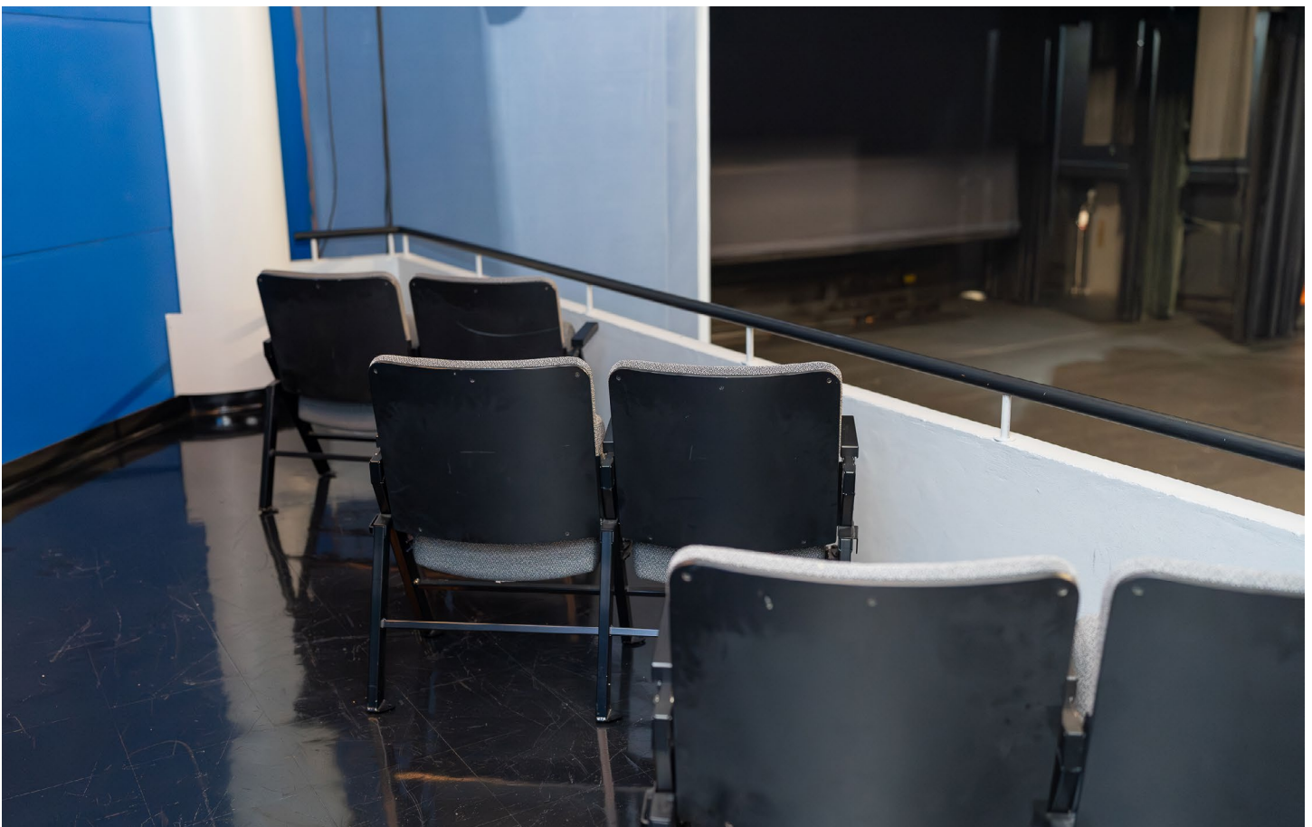
Image Description: The box seating area at the Fleck Dance Theatre. The seats are on an angle to the stage.

Boxes allow small groups of people to sit together away from the rest of the audience.