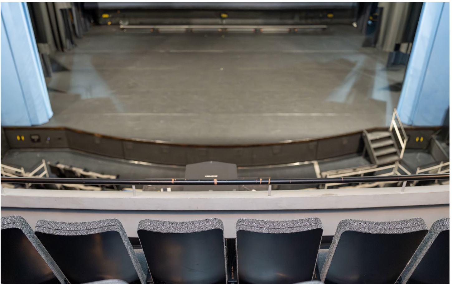
Image Description: The front row and railing of the balcony seating area at the Fleck Dance Theatre. Beyond, and below, the safety railing is the stage.

There are some seats at the above the main floor of the auditorium – this area is called the balcony. The balcony is a little further away from the stage and a little darker. There are stairs to get up to the balcony.