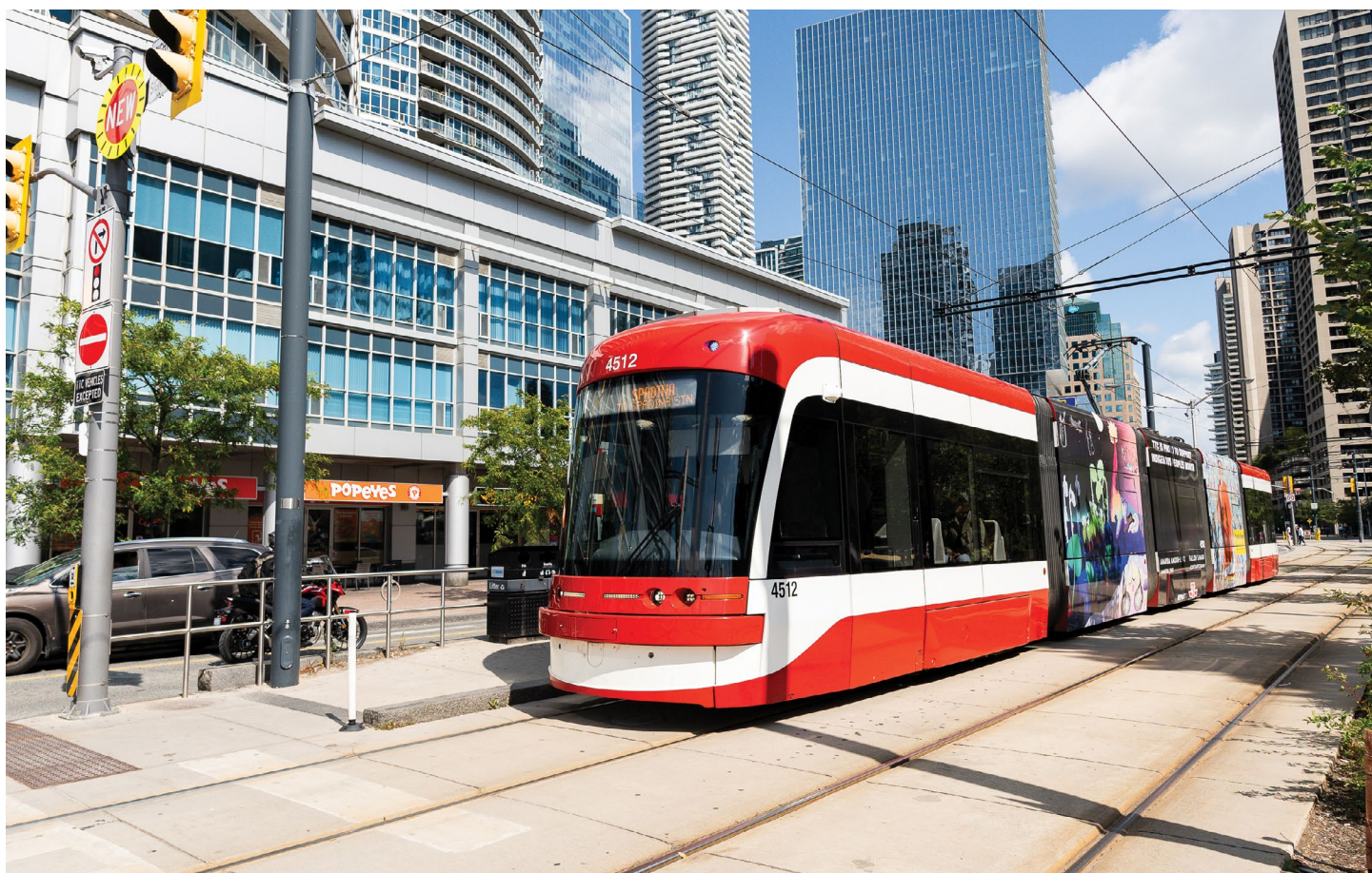
Image Description: A streetcar at the Harbourfront streetcar stop.

If we take the streetcar we will get off at the Harbourfront Centre stop. This stop is right in front of Harbourfront Centre. If I need to cross the street, I should do this at the traffic lights.