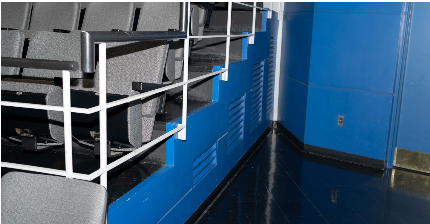
Image Description: The area where strollers and mobility devices will be stored during the performance. The wall is blue and the area is beside the seats on the main floor.

This is done because the theatre cannot have stroller and walkers in the aisles during the show. I won't be worried as I know that usher will bring it back to me whenever I need it.