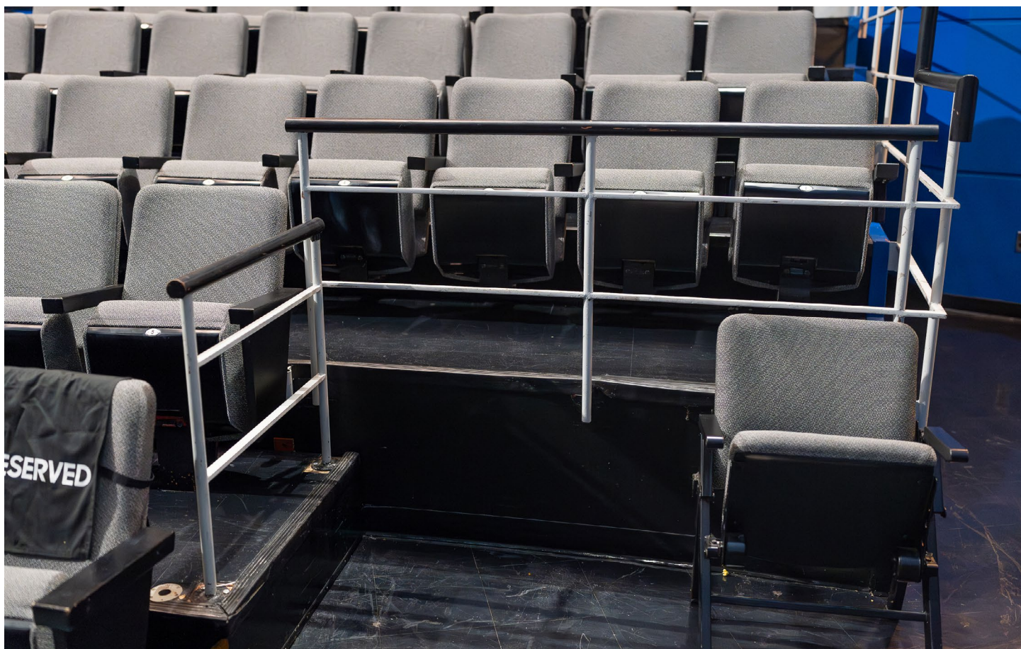
Image Description: An open space where wheelchairs and other accessible seating devices can be accommodated inside the auditorium.

There are seats at the front of the auditorium which can be removed to make room for a wheelchair/mobility device. Beside these seats are seats for family members of wheelchair/mobility device users.