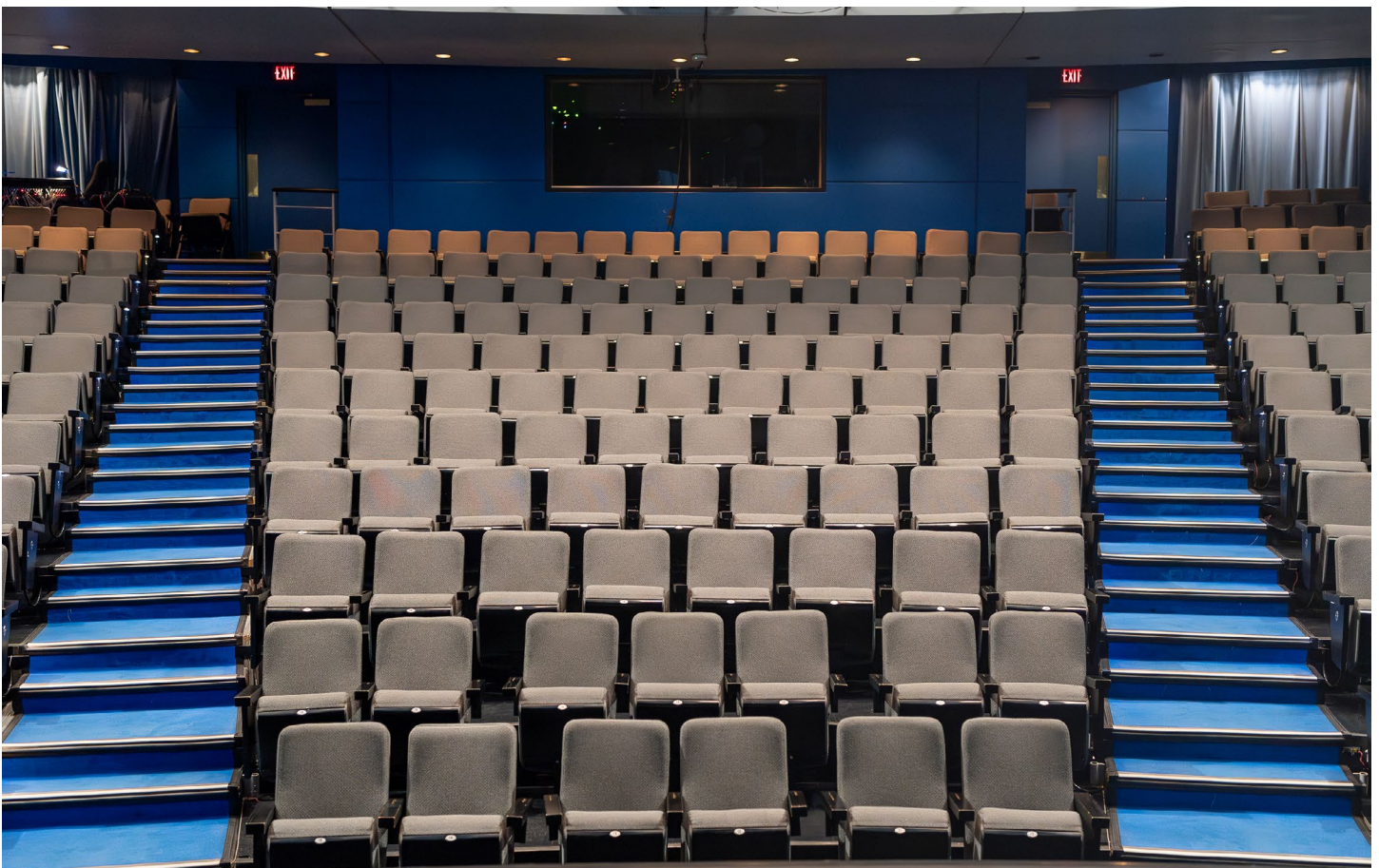
Image Description: The main floor seats, and aisles, at the Fleck Dance Theatre. The front rows of seats are lower than the back rows of seats.

The seats at the front of the auditorium are lower than those at the back. I will use the stairs to get to my seat if I need to.