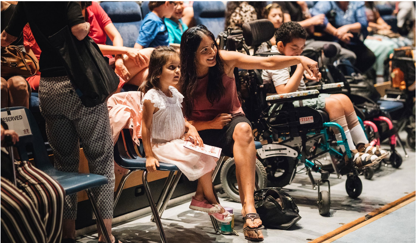
Image Description: Audience members seated in a theatre auditorium. At the front of the rows sit a young girl and an adult. The adult is pointing and smiling as the young girl looks on.

Relaxed Performances are for anyone who would like a more gentle approach to a performance, such as people who are Neurodiverse or Autistic, people with Developmental Disabilities, people who experience anxiety, and anyone who feels a more relaxed atmosphere will make their visit to the ballet more enjoyable and approachable.