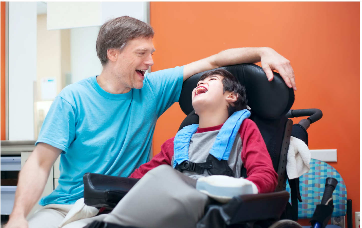
Image Description: A boy in a mobility device laughs. A man sits beside him and is also laughing.

During the performance I can clap, laugh, smile and feel any way that the dancing helps me to feel.