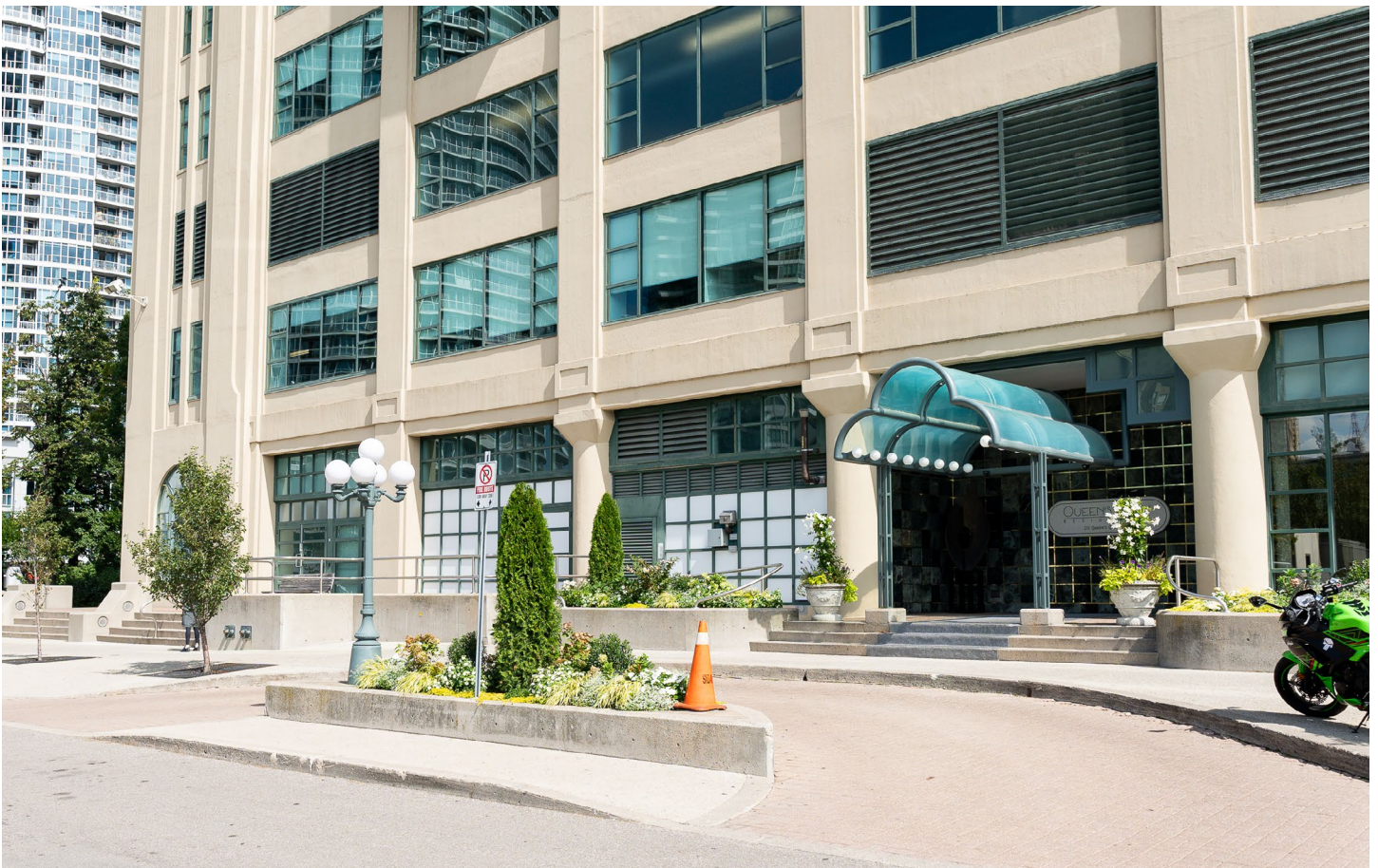
Image Description: The outside of the west side of the Queen's Quay Terminal building.

Once we have arrived at Queen's Quay Terminal we can go inside. There are many entrances to Queen's Quay Terminal. We can use any entrance but the easiest would be the one that faces the main Harbourfront Centre building. It has a ramp and stairs.