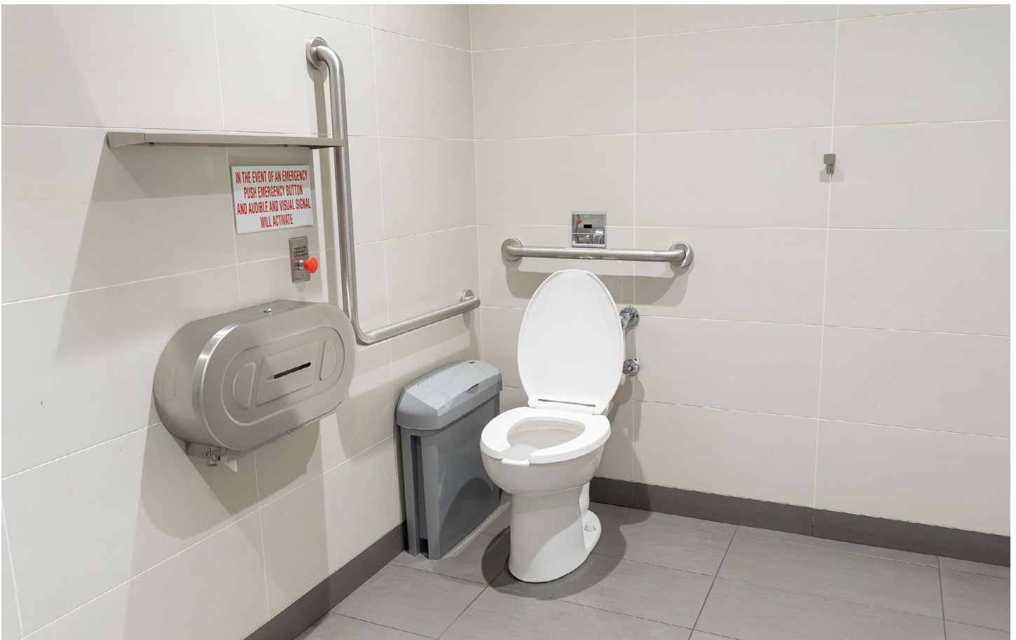
Image Description: The inside of the accessible washroom on the first floor of Queen's Quay Terminal.

The accessible washroom is on the main floor of Queen's Quay Terminal. If I need to use the accessible washroom, I can use it before going upstairs to the theatre. There is also an accessible stall in the washroom in the theatre lobby.