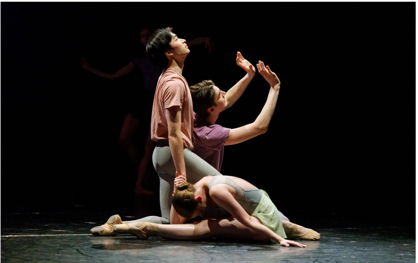
Image Description: Three ballet dancers on stage. Two men kneel behind a woman who is folded over one leg with her head on her thigh and her foot outstretched on the floor.

When it is time for the performance to begin the lights will dim but not go out. I can tell the performance is starting because the hosts will come on stage and welcome the audience to the performance.