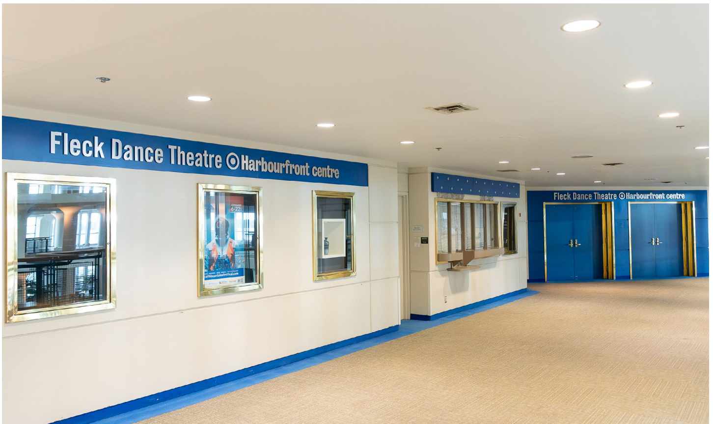
Image Description: The outside of the Fleck Dance Theatre. The walls are light brown and the doors to the theatre lobby are blue. The carpet is brown.

The Fleck Dance Theatre is on the third floor of the Queen's Quay Terminal building.