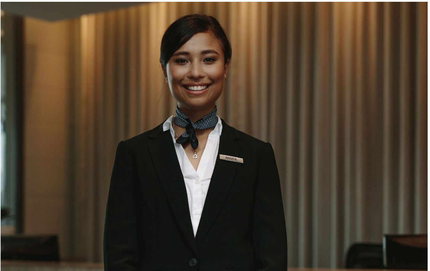
Image Description: An usher smiles widely at the camera. They are wearing a uniform.

All ushers and volunteers at the performance are there to help me and everyone else who has come to the YOU dance performance.