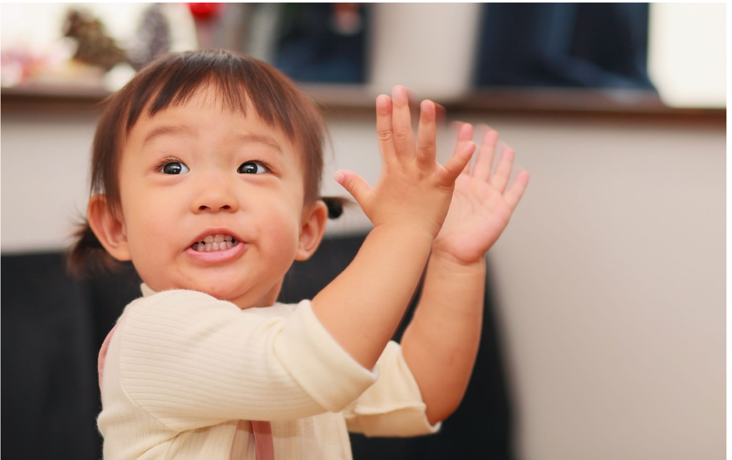
Image Description: A small child claps their hands and looks happy.

At the end of each dance, I can show the dancers how much I liked it by clapping, saying “bravo” and by using any other way that feels good for me.