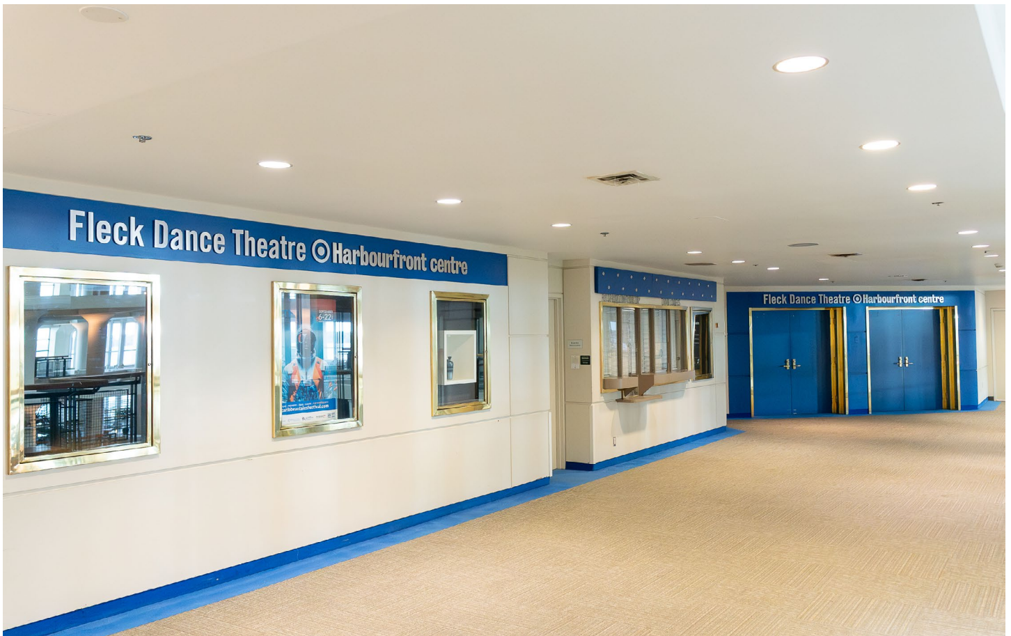
Image Description: The outside of the Fleck Dance Theatre. The walls are light brown and the doors to the theatre lobby are blue. The carpet is brown.

When I reach the third floor, I will be at the Fleck Dance Theatre. Once we have arrived at the theatre, we can go inside and wait in the lobby if we like. We can also go inside to use the washrooms.