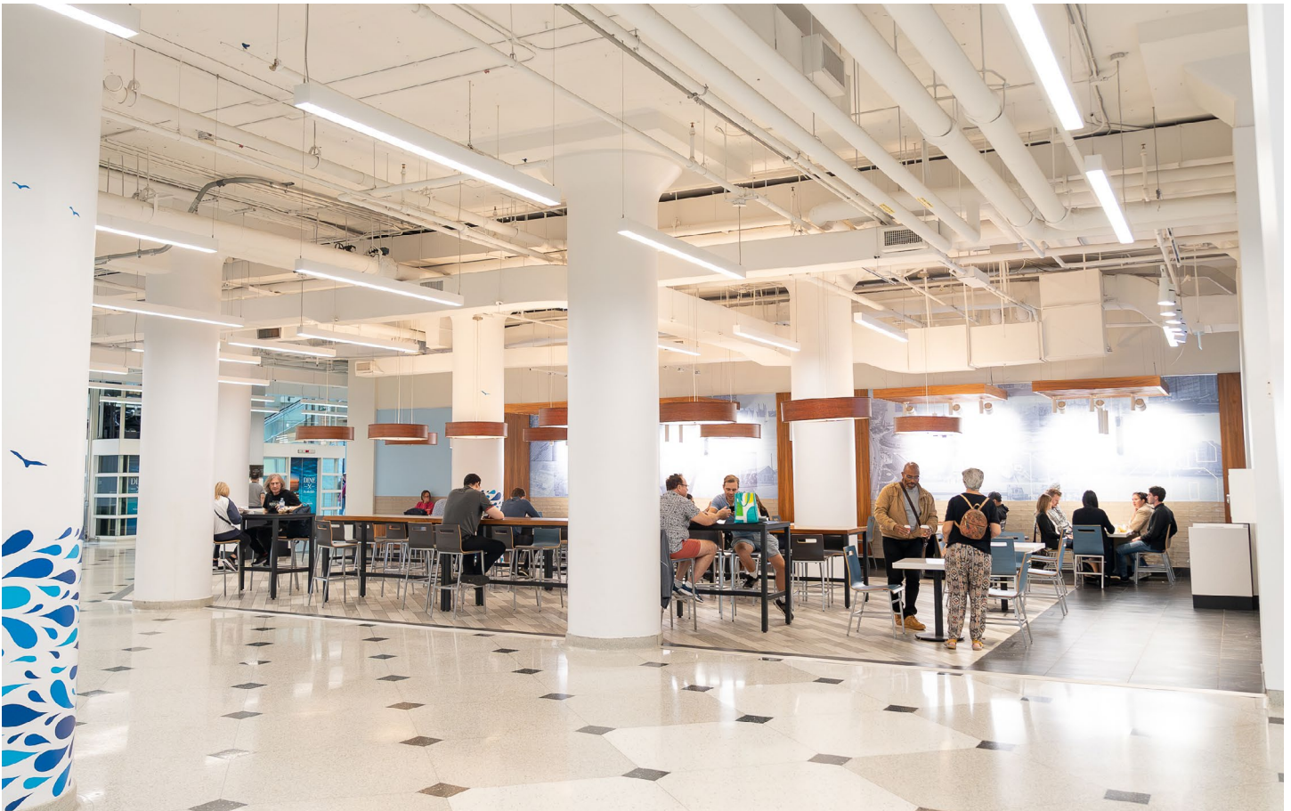
Image Description: The food court inside Queen's Quay Terminal. People are sitting at, and standing around, tables.

Queen's Quay Terminal is a public building with many restaurants, stores and businesses inside. I will go past some of the businesses and towards the fountains. The washrooms and the stairs, escalator and elevators to the Fleck Dance Theatre are by the fountains.