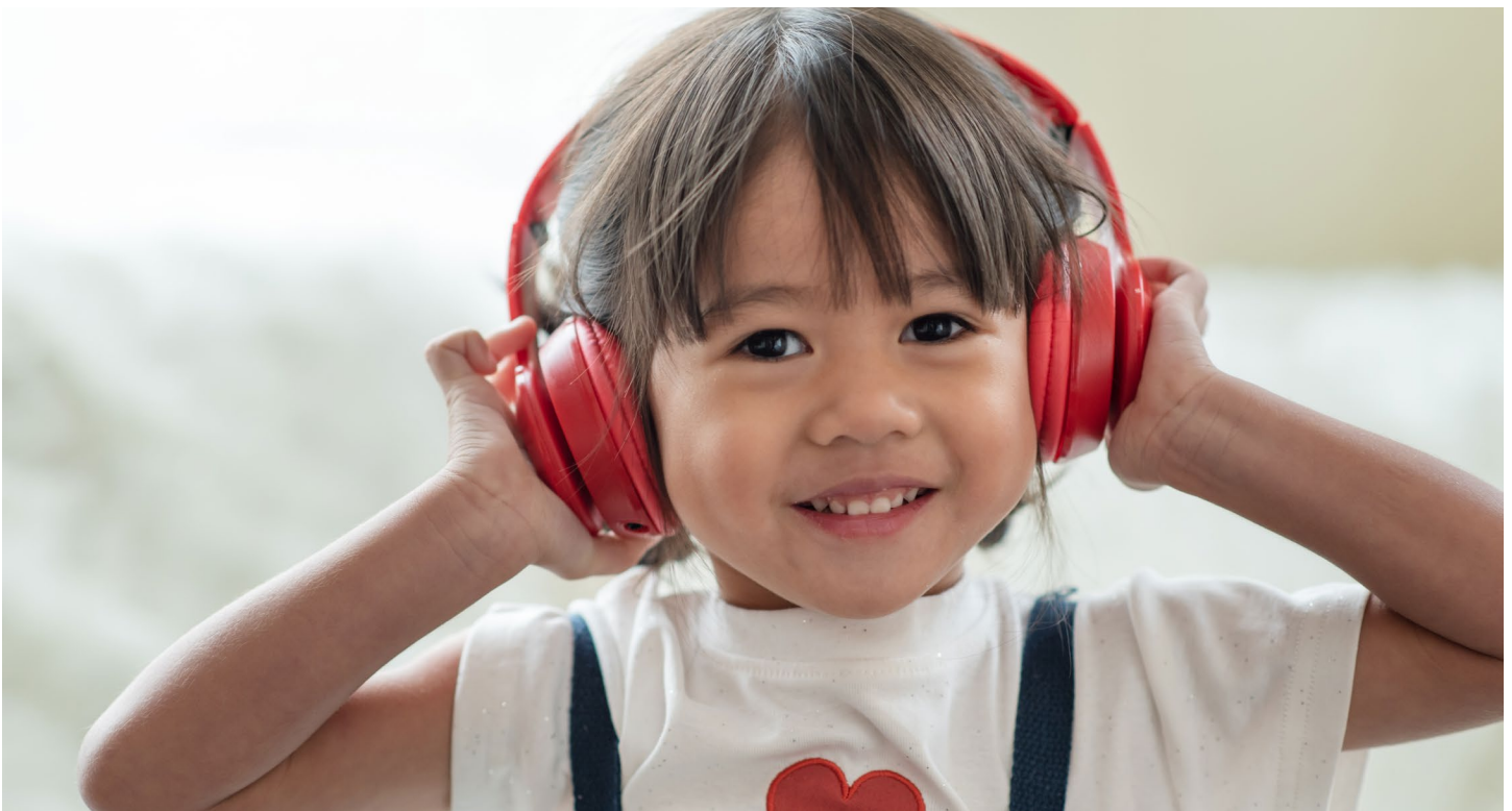
Image Description: A smiling child who has on red sound dampening headphones.

If I don't have my own sound dampening headphones, I can borrow some from The National Ballet of Canada. I can ask an usher for help getting them. I can also choose to take a break in the Quiet Room.