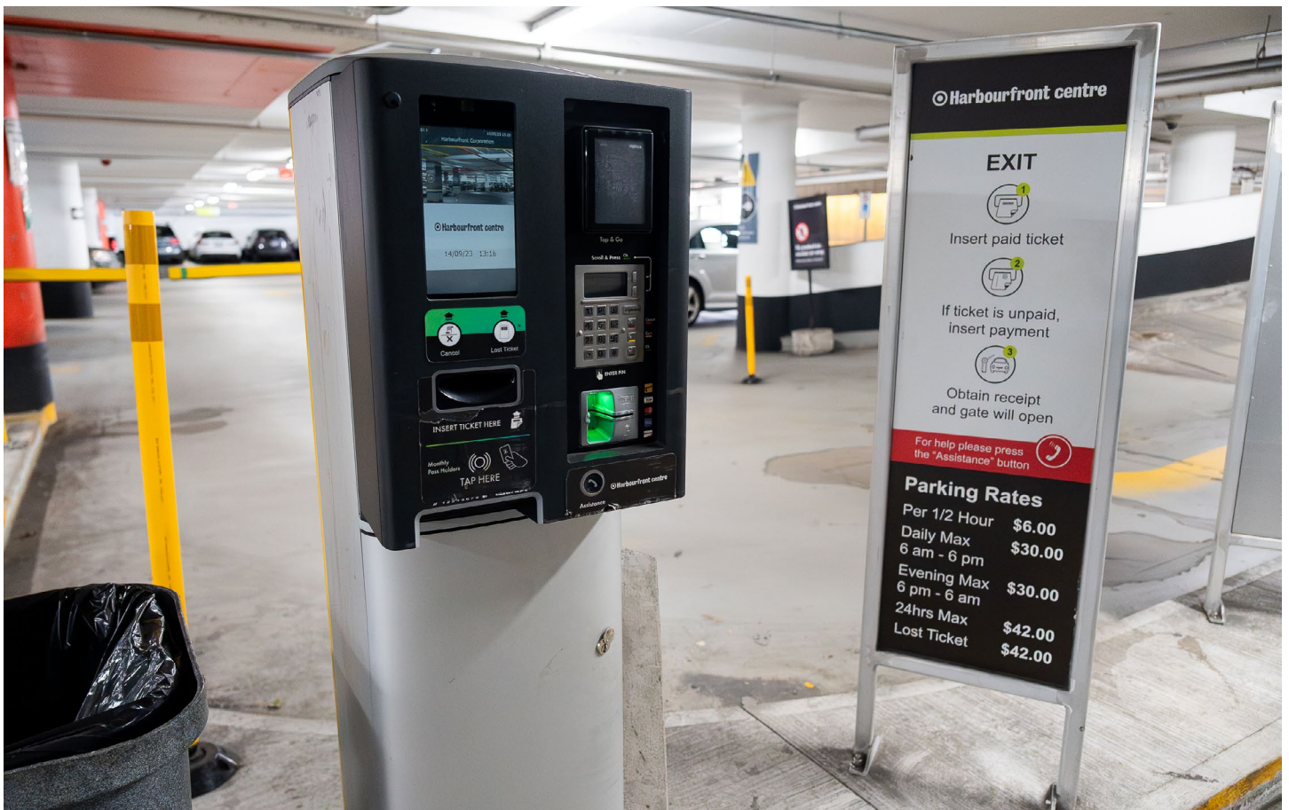
Image Description: The parking payment machine at the Harbourfront parking lot.

To pay for parking we can use our credit or debit card.