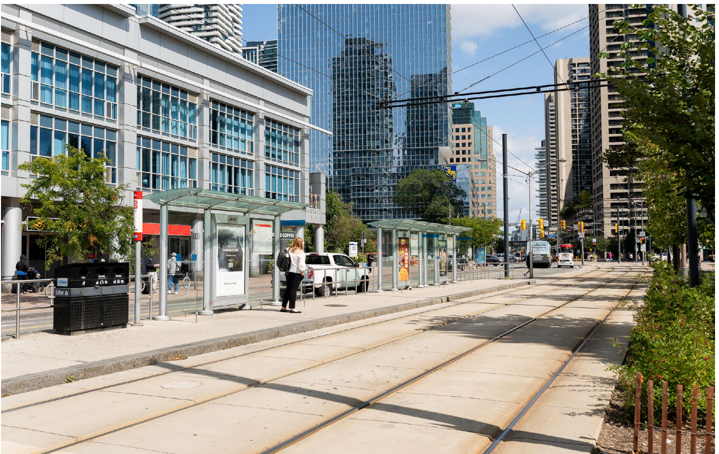
Image Description: The streetcar tracks and stop and traffic lights outside of Queen's Quay Terminal.

There are lots of other parking lots around the area. We can choose where we park. Once the car is parked, I will walk to the Queen's Quay Terminal Building. If I need to cross the street, I should do this at the traffic lights.