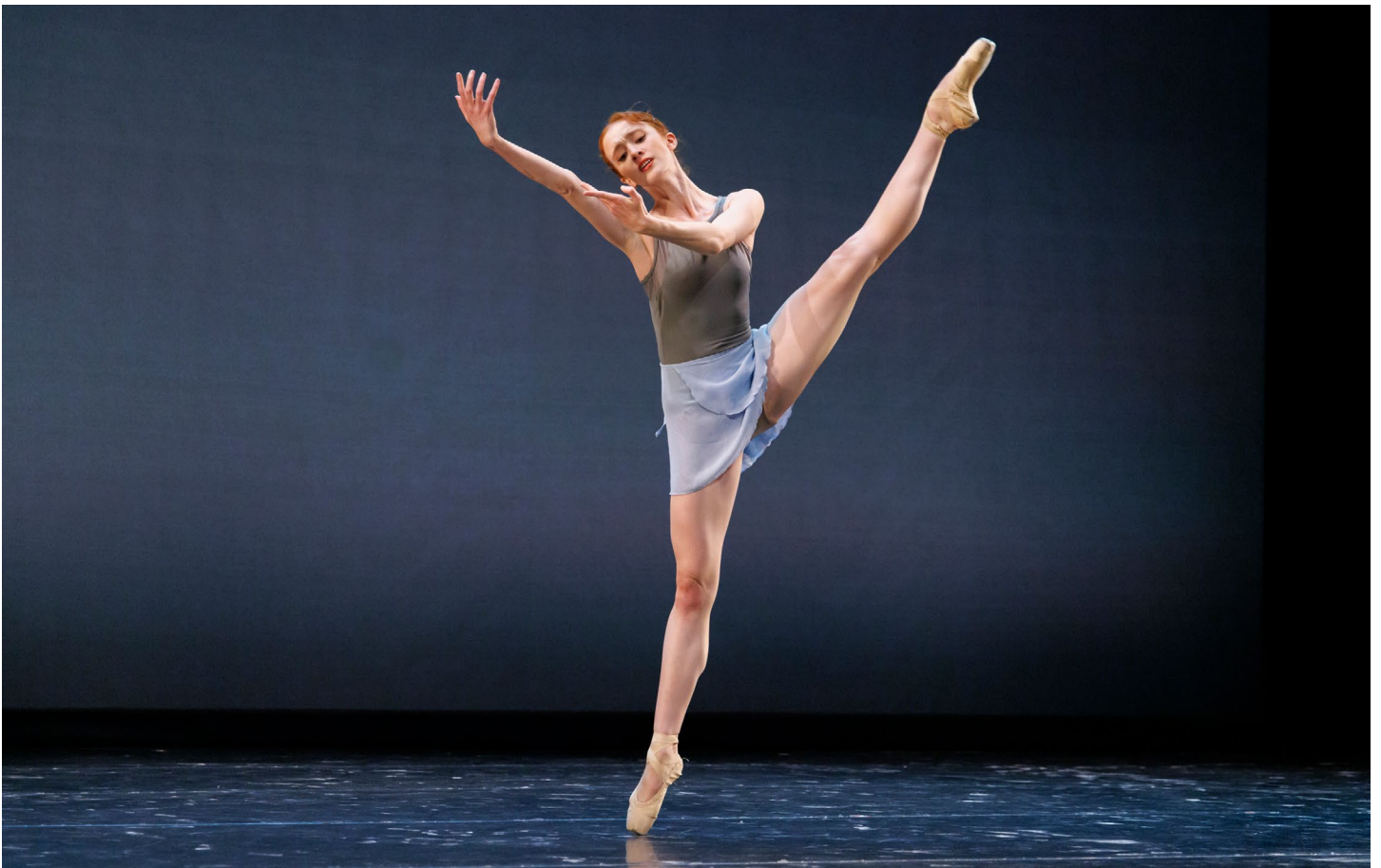
Image Description: A ballet dancer is on stage. She is standing on on the tip of her toes, with her left leg pointed in the air. Her arms are up and on her right side. Her red hair is back in a bun.

I am going to see a dance performance by The National Ballet of Canada.