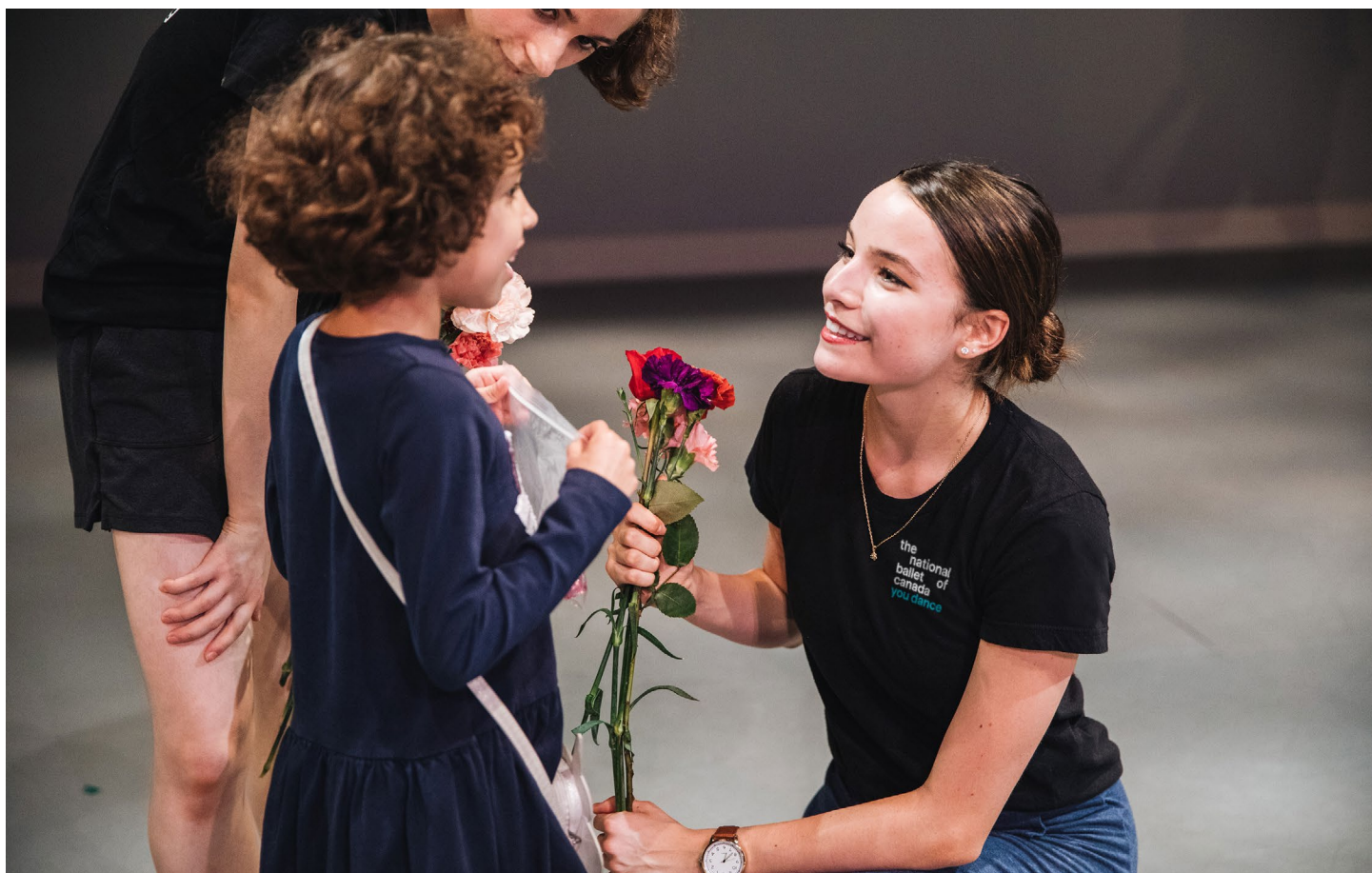
Image Description: A dancer in a YOU dance t-shirt kneels before a child. They are both smiling. The dancer is holding flowers.

At the end of the show, the Host will invite the audience to meet some of the dancers! I will follow the host's directions carefully so that I can meet the dancers. I do not have to meet the dancers if I do not want to.