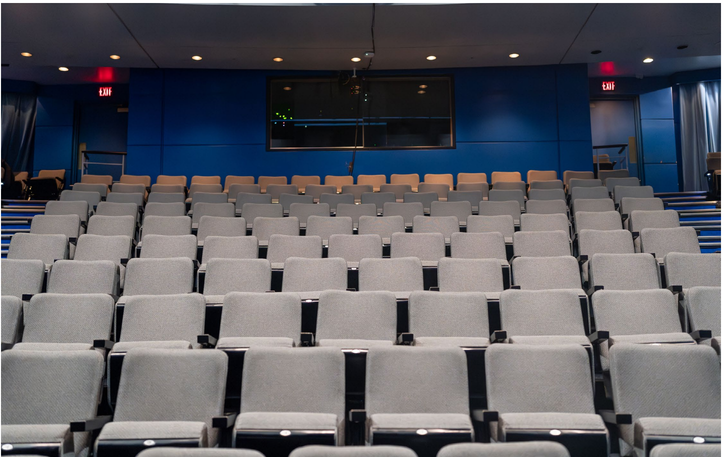
Image Description: The main floor seating area at the Fleck Dance Theatre.

Seating at the YOU dance performance is “General Seating”, that means that I can choose where I would like to sit. I cannot choose a seat where someone else is already sitting or has claimed as their seat, nor can I choose to sit in the accessible seats unless my family/group needs them.