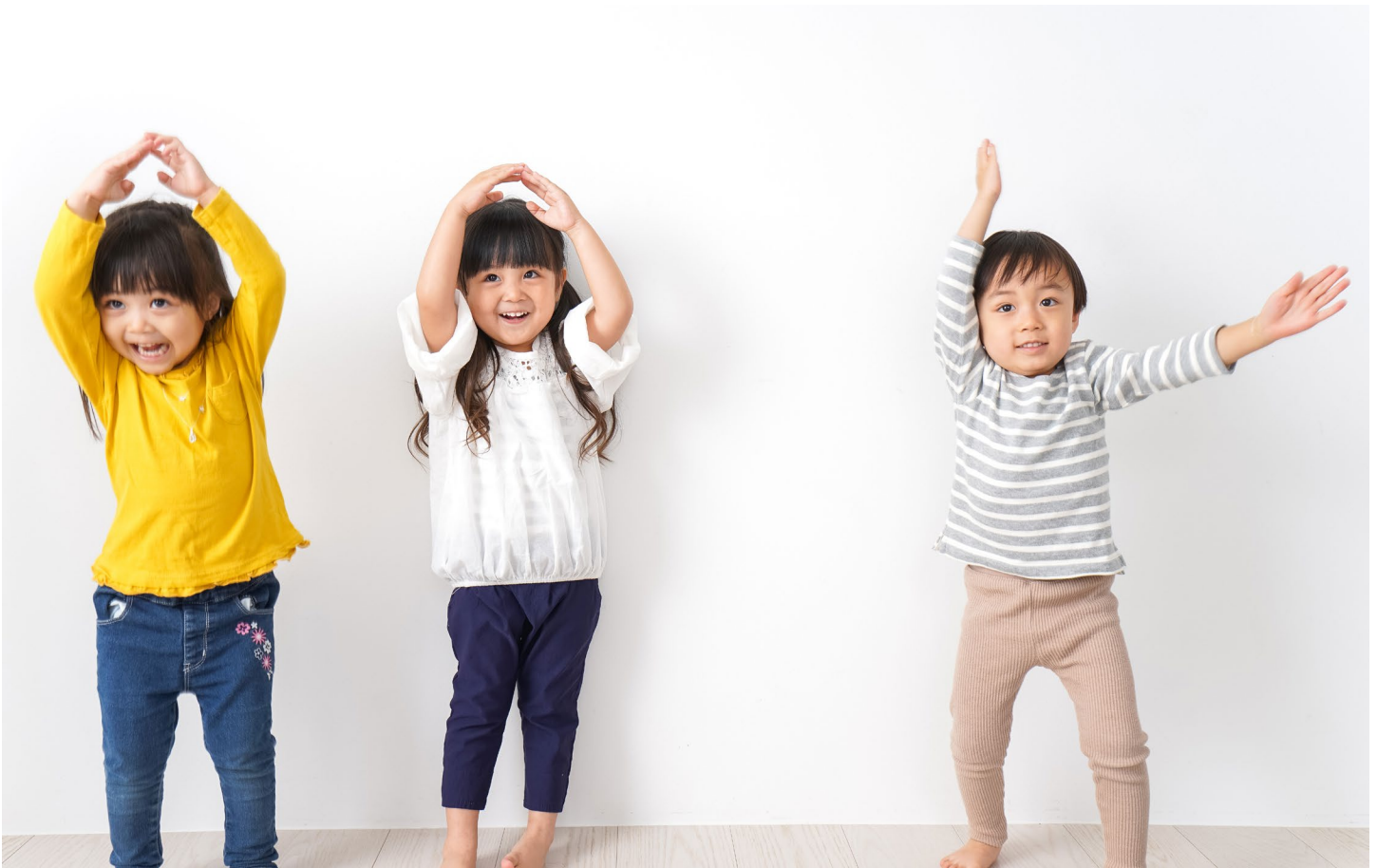
Image Description: Three children are dancing in front of a light grey wall.

I can do what I need to enjoy it more – I can doodle, fidget, stim, dance, move, vocalize, sit, lay, talk and more. I can be me!