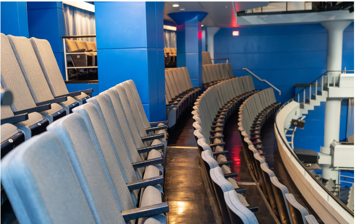
Image Description: The balcony seating area from the side. The rows are curved and there is a safety railing at the front of the seats.

I will enter the balcony from the back and walk down the stairs to a seat. The balcony is steep and I will walk slowly. There is a long rail at the front of the balcony. The rail is there for everyone's safety. I will not lean over the rail.