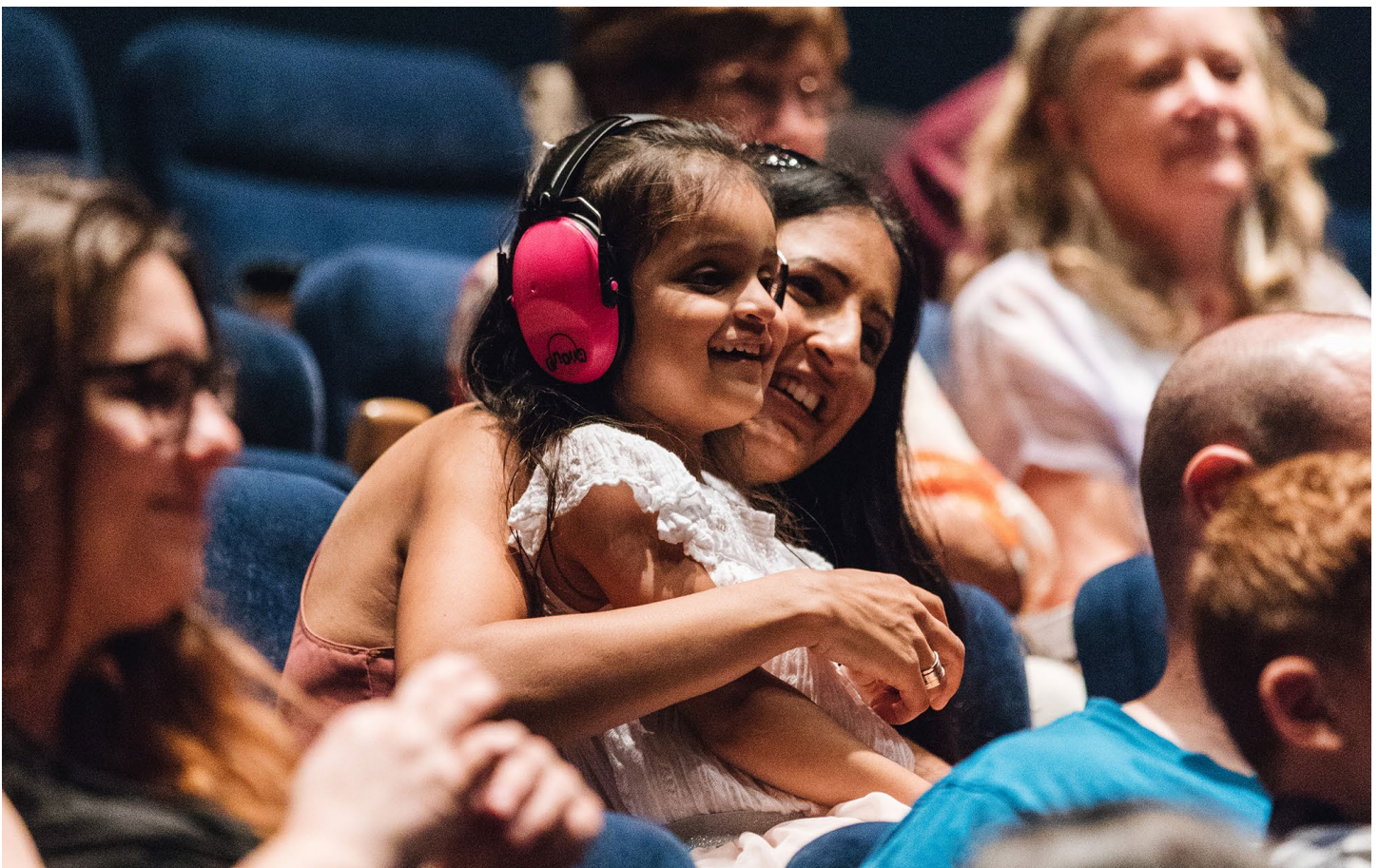
Image Description: A child sits in an adult's arms in the auditorium. The child wears sound dampening headphones and is smiling. The adult is also smiling.

When it is time to find our seats, the ushers will open the doors to the auditorium. They will let the audience know the doors are open and I will go into the auditorium and find my seat.