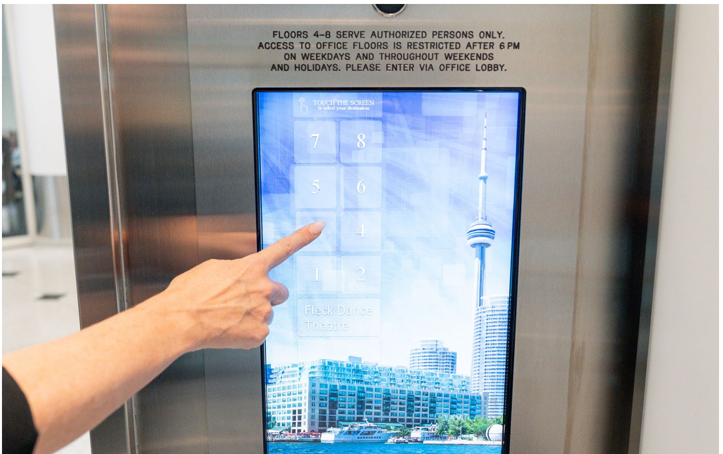
Image Description: Inside the elevator up to the Fleck Dance Theatre. A hand is pointing to the buttons on the screen inside the elevator.

If I take the elevator, there is a button just for the theatre. I can press the “3” button and the elevator will take me to the theatre.