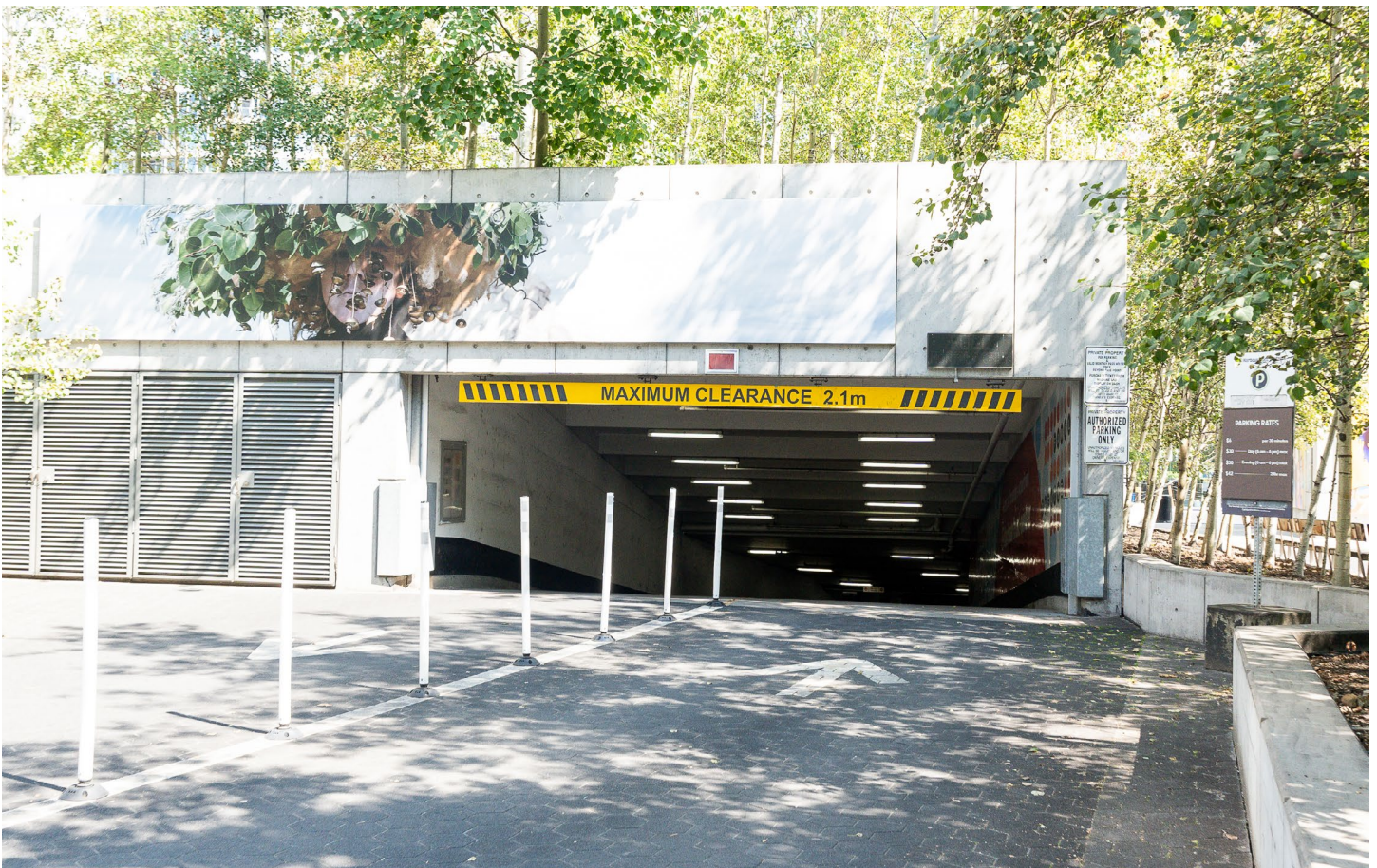
Image Description: The entrance to the Harbourfront parking lot off of Queens Quay.

If my family drives, we can park at the underground parking lot by Harbourfront Centre. It usually costs $30 to park here but we should come prepared to pay more just in case.