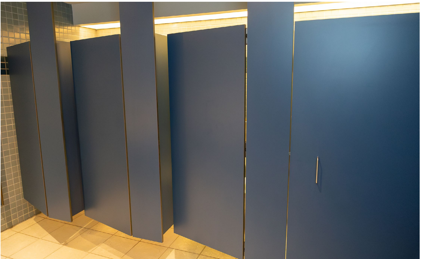
Image Description: Washroom stalls. The doors are blue and the floor is tiled. There is an accessible stall on the right.

The washrooms are bright and the toilets and sinks are manual (that means I control the flush and the taps). The washroom doors are heavy and may create a large banging sound when I let them go. I can put my hands over my ears if I need to and I can let the doors go gently.