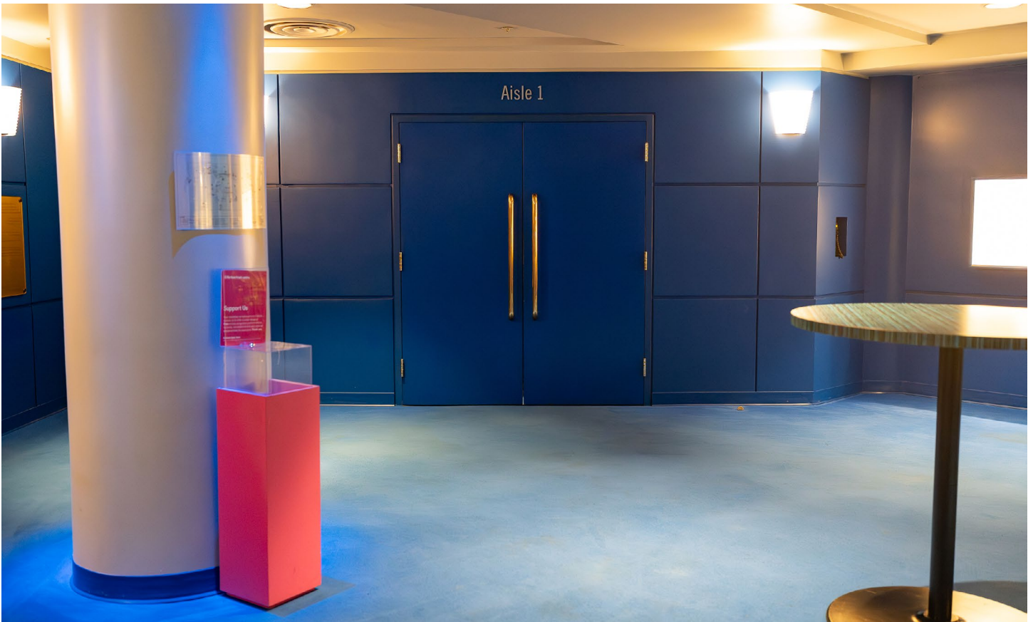
Image Description: Inside the main floor lobby. The doors to the auditorium are blue. There is a pillar on the left and a tall table on the right.

If it feels too full, I can go outside by the elevators, downstairs where the fountains are or I can go to the quiet room. Or, if the weather is nice, we may decide to wait outside.