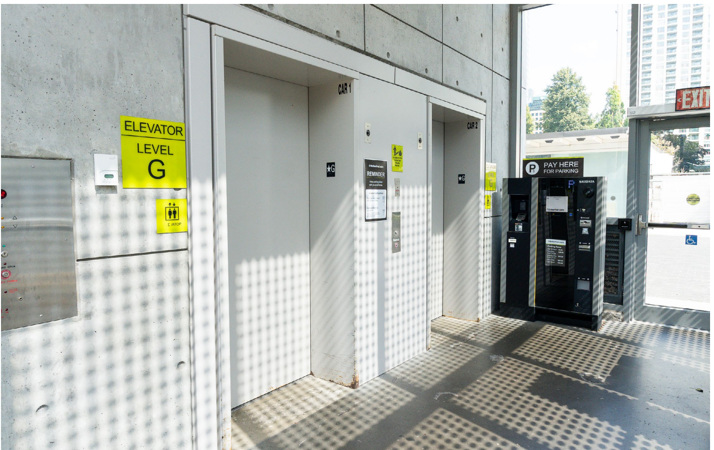
Image Description: The elevators to the underground parking. There is a pay station machine beside the far elevator. This photos shows the elevators at ground level.

To get out of the underground parking, my family and I will need to take the stairs or the elevator. The elevator will take us up to ground level beside Queen's Quay Terminal.