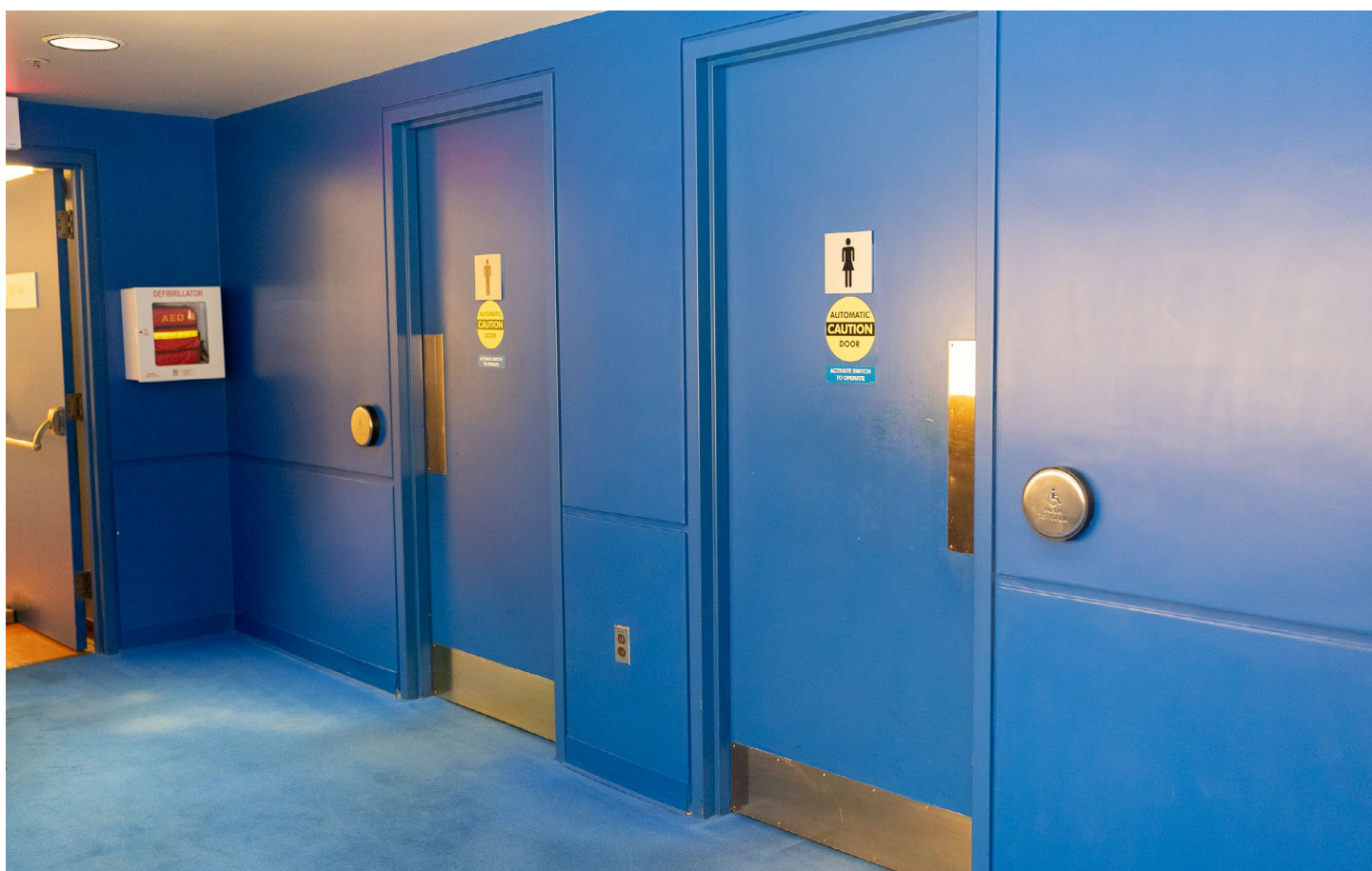
Image Description: The doors to the washrooms inside the Fleck Dance Theatre lobby. The doors are blue and have accessible buttons beside them.

There are washrooms in the lobby of the Fleck Dance Theatre. There are washrooms for men and washrooms for women. There is an accessible stall in both washrooms. We will choose the washroom we are comfortable using and go to that one.