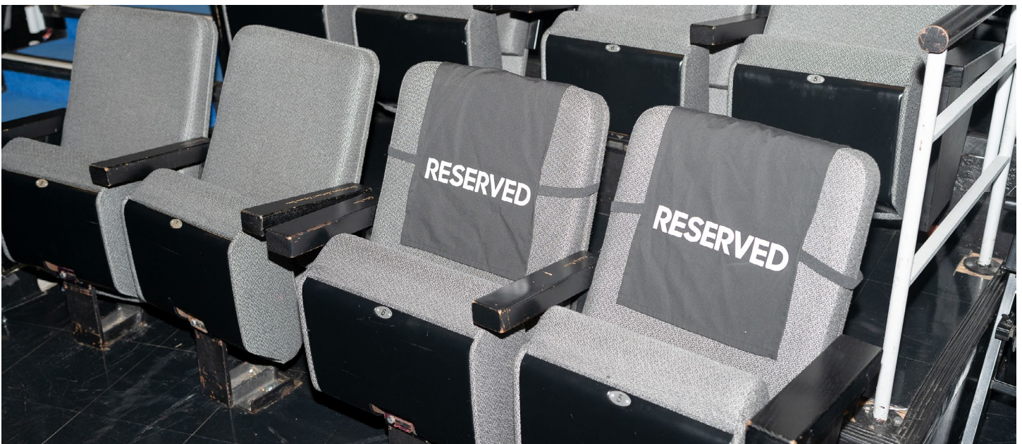
Image Description: Two rows of seats, two of the seats have reserved signs on them. The bottom of all of the seats are folded up.

There are many areas of seats in the auditorium – some are in long rows and some are in short rows. I can pick a seat where I feel comfortable with my family/group. If I require accessible seating, I can request this ahead of time.