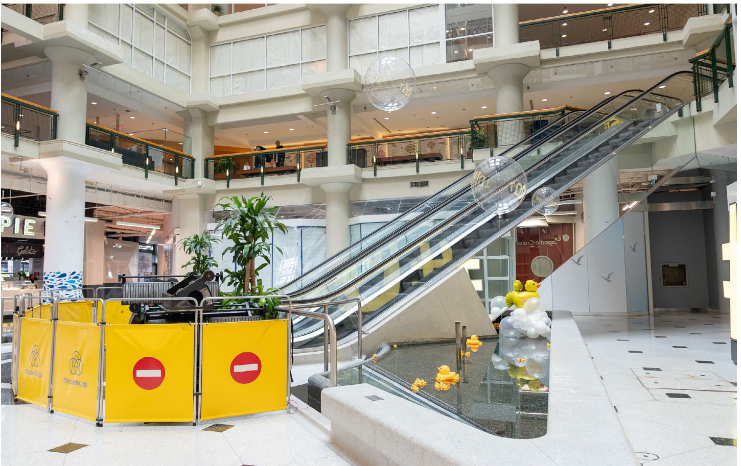
Image Description: The escalator leading from the first floor up to the Fleck Dance Theatre. In this photo there are yellow barriers around the escalator with red do not enter symbols on them.

Recently the escalator has been under construction. It may not be working on the day of the YOU dance performance. If it is not working it will have yellow barriers around it. I will not go on the escalator if there are yellow barriers around it.