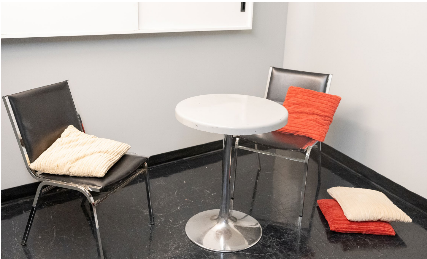
Image Description: The Quiet Room. A table and two chairs with cushions on them and on the floor.

If it is loud or overwhelming in the auditorium or the lobby, I can use the Quiet Room. The Quiet Room is on the main floor opposite the washrooms. If I need to use the Quiet Room I can ask an usher to show me where it is.